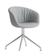
AAC 21 Soft