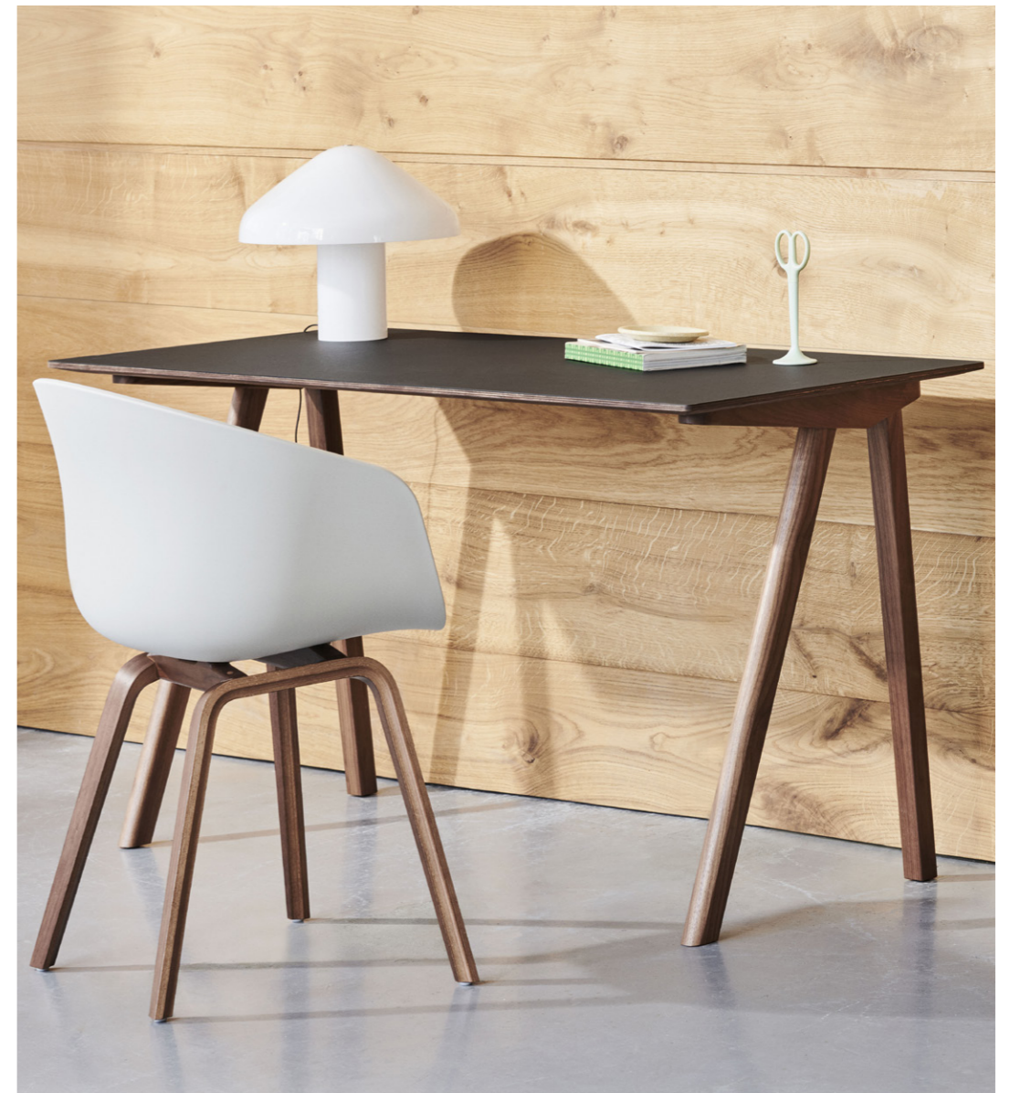
AAC 22 | White shell | Water-based lacquered walnut base