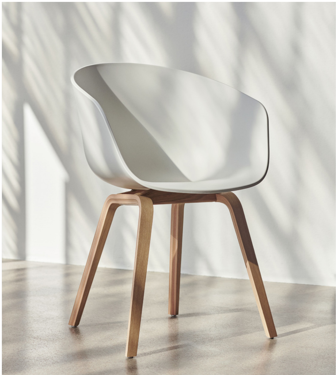
AAC 22 | White shell | Water-based lacquered oak base