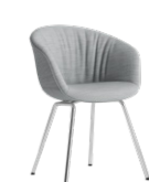
AAC 27 Soft