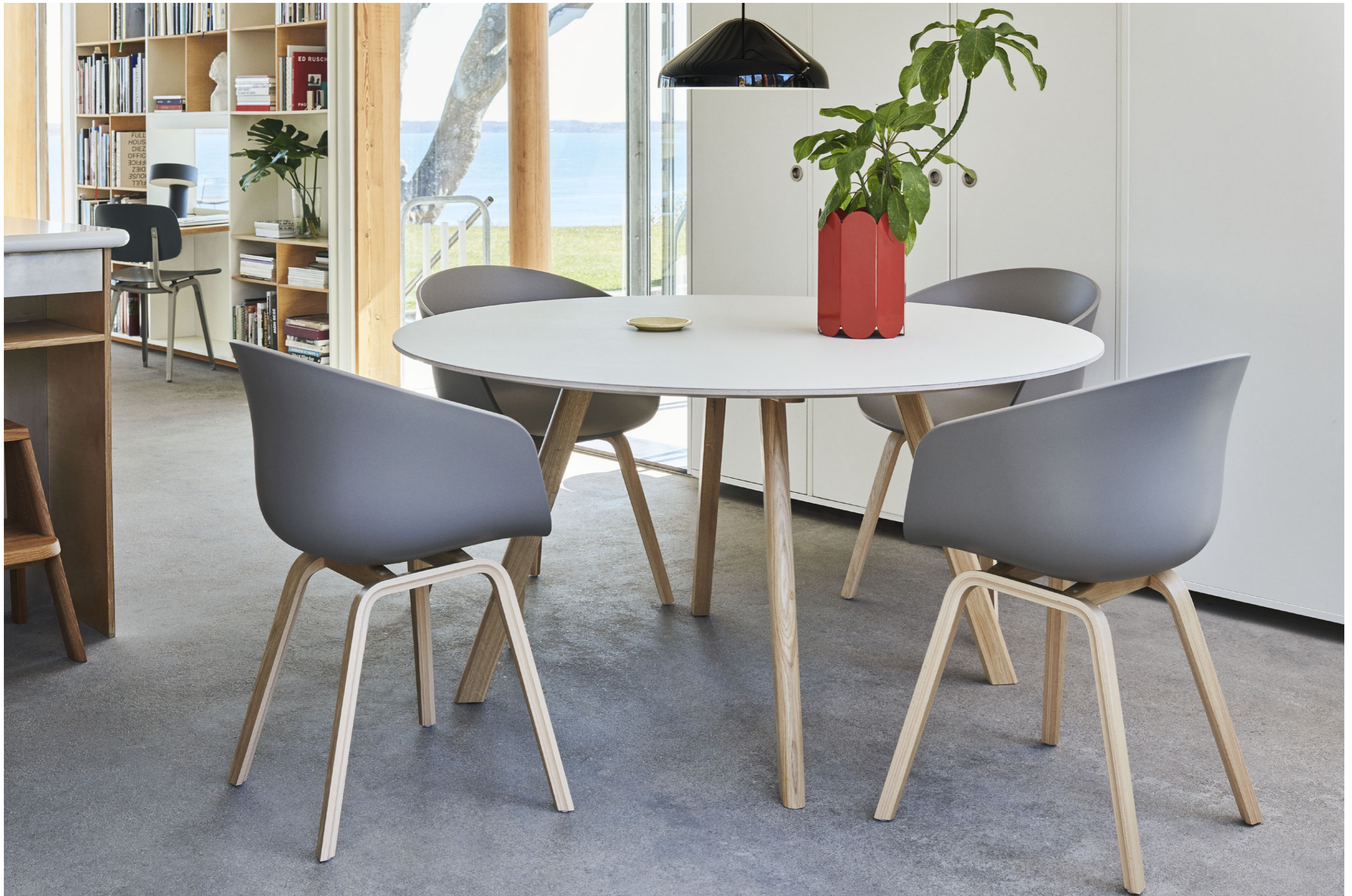
AAC 22 | Concrete grey shell | Water-based lacquered oak base