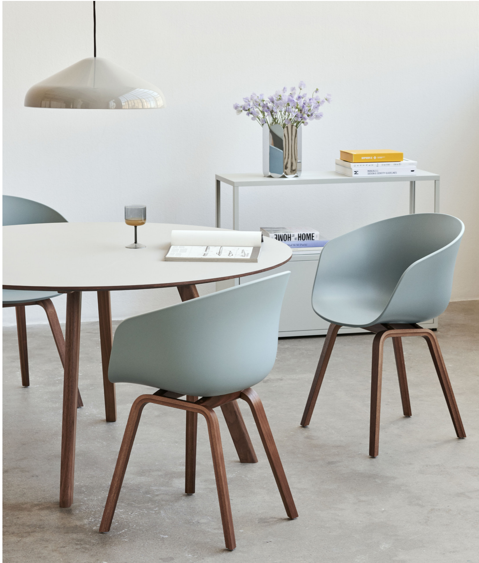
AAC 22 | Dusty blue shell | Water-based lacquered walnut base