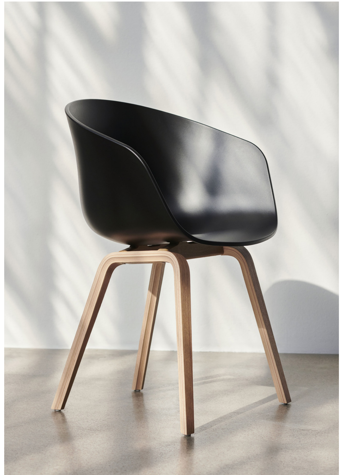
AAC 22 | Black shell | Water-based lacquered oak base