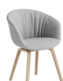
AAC 23 Soft