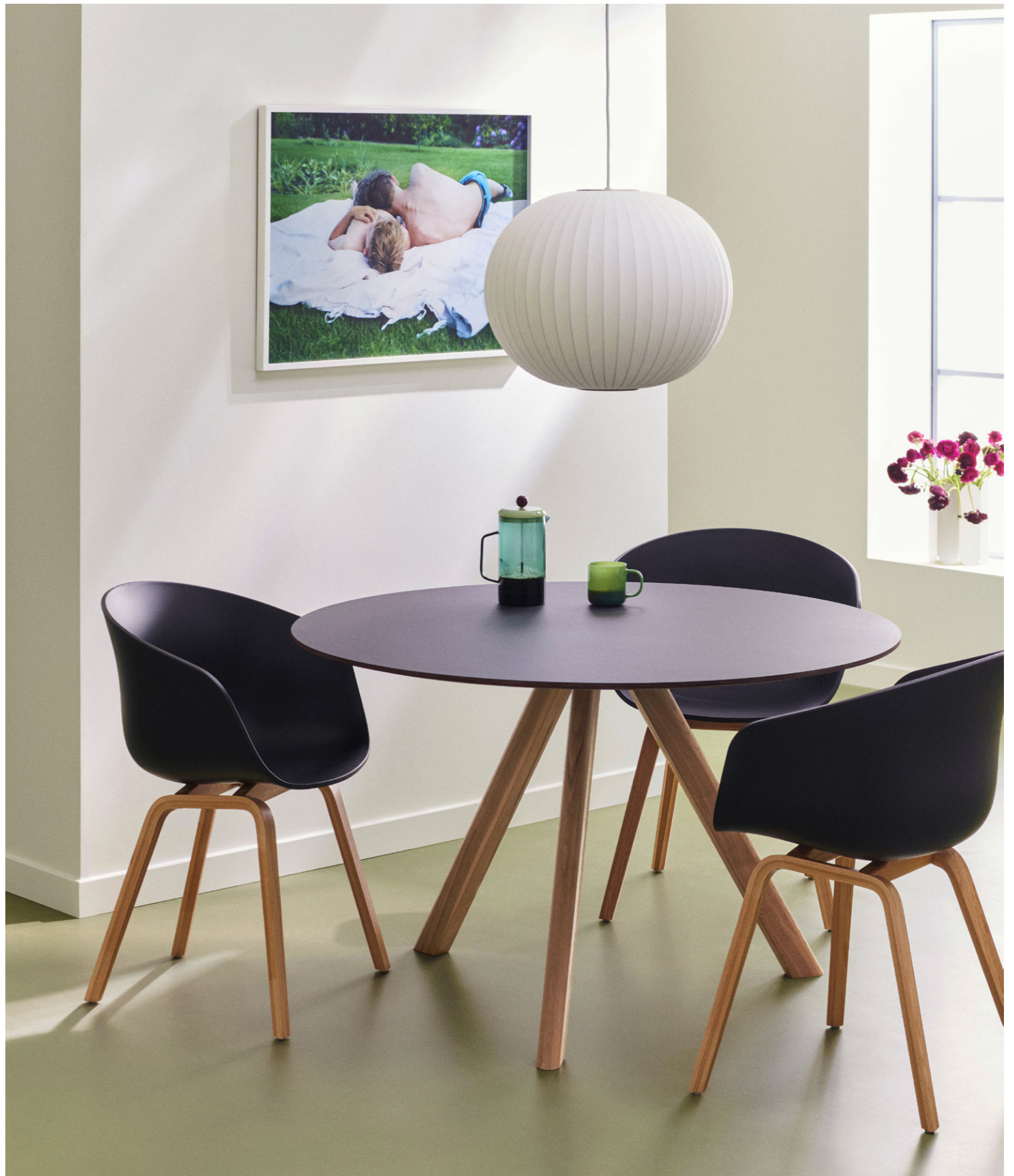
AAC 22 | Black shell | Water-based lacquered oak base