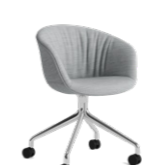
AAC 25 Soft