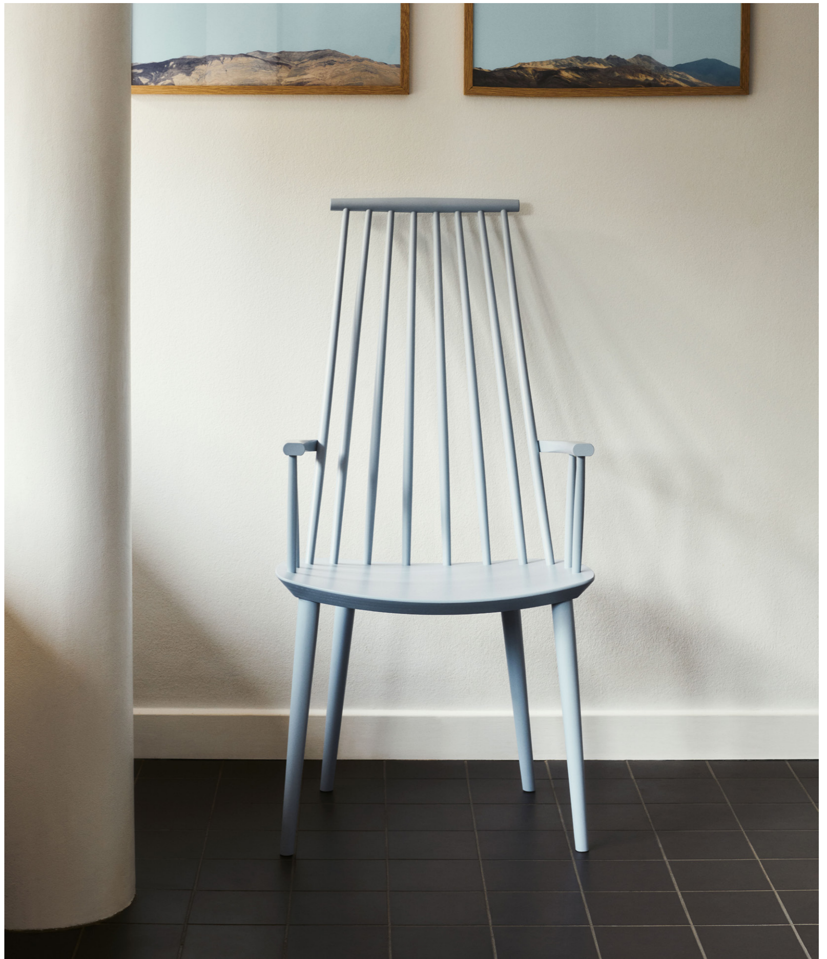
J110 Chair | Slate blue water-based lacquered beech