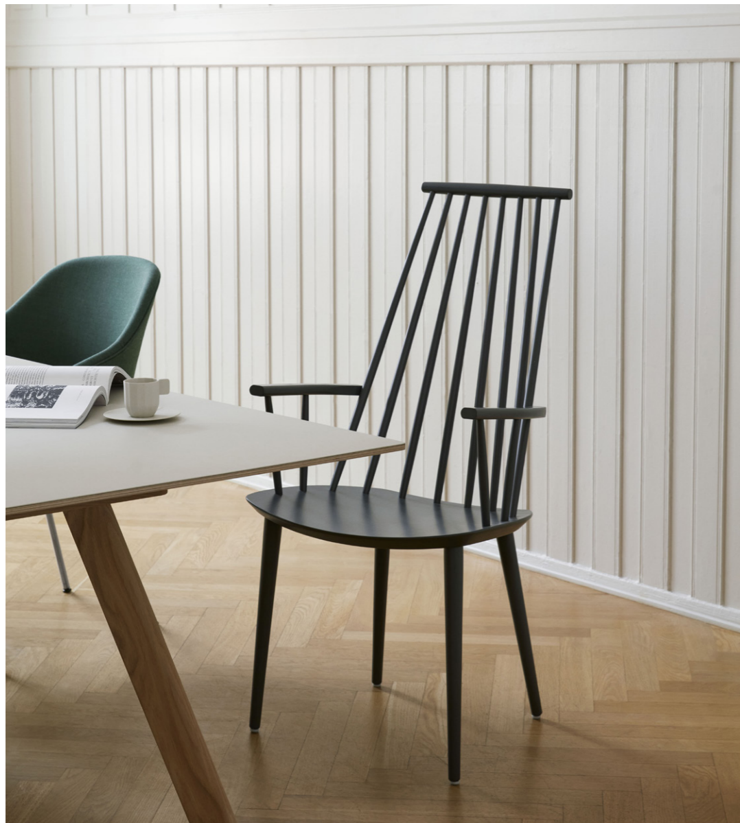
J110 Chair | Black water-based lacquered beech