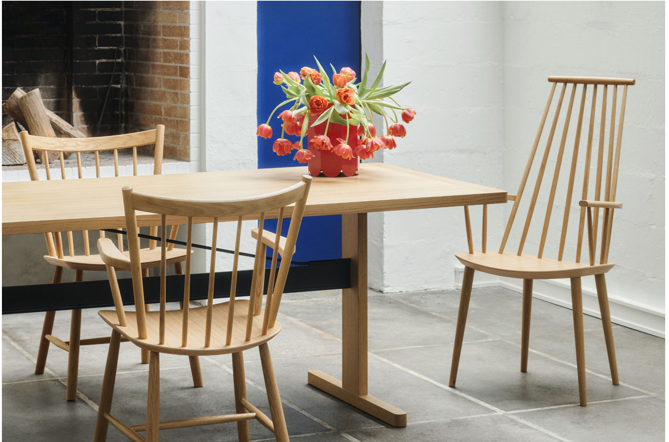
J110 Chair | Water-based lacquered oak