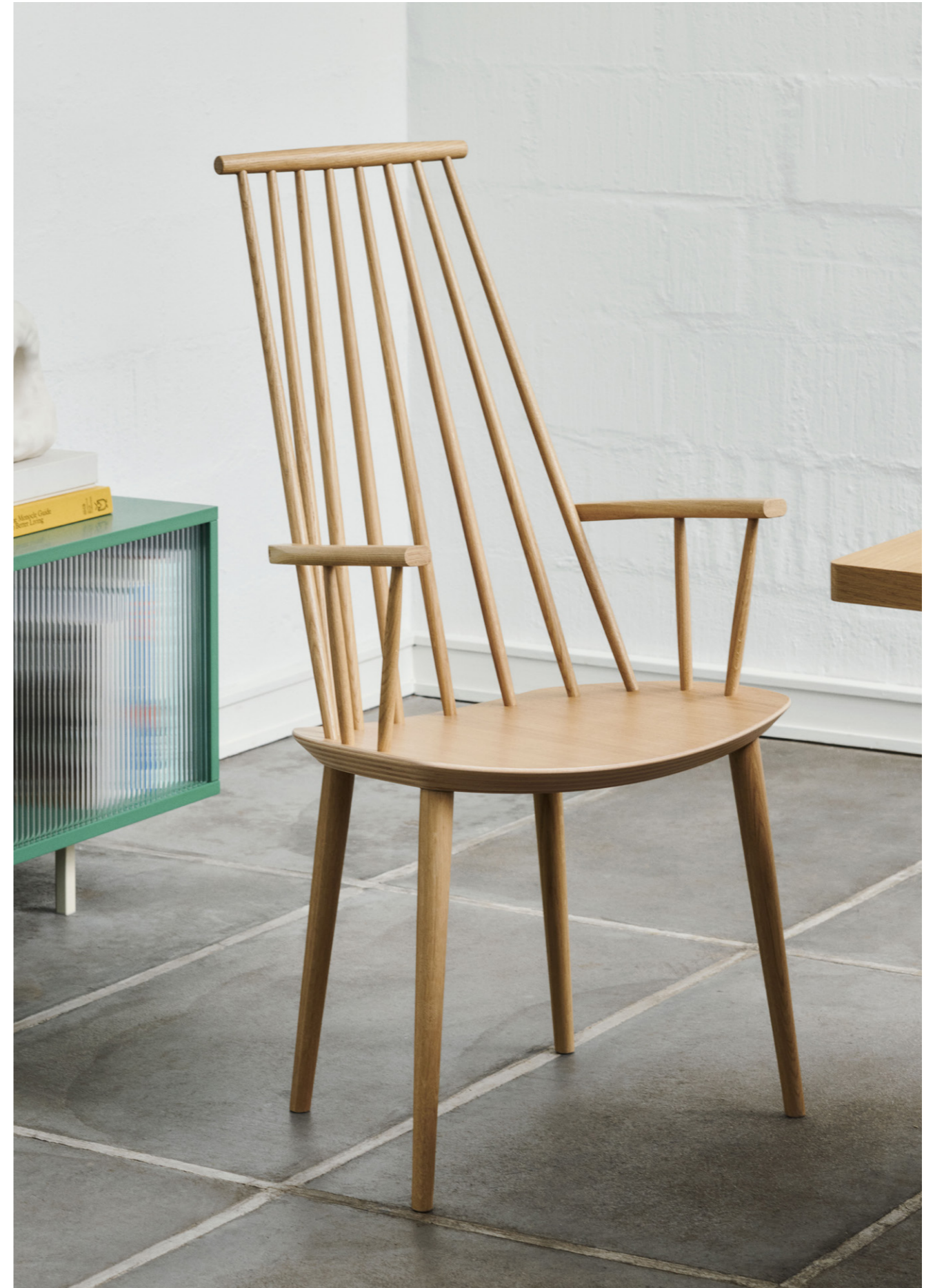
J110 Chair | Water-based lacquered oak