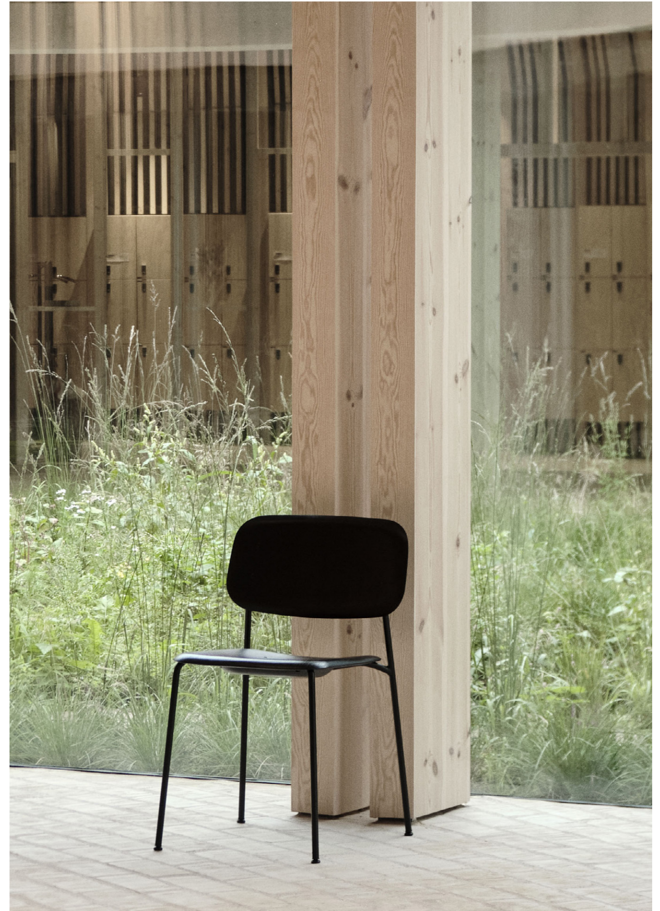
Soft Edge 40 Chair | Black water-based lacquered oak seat & back | Black powder coated base