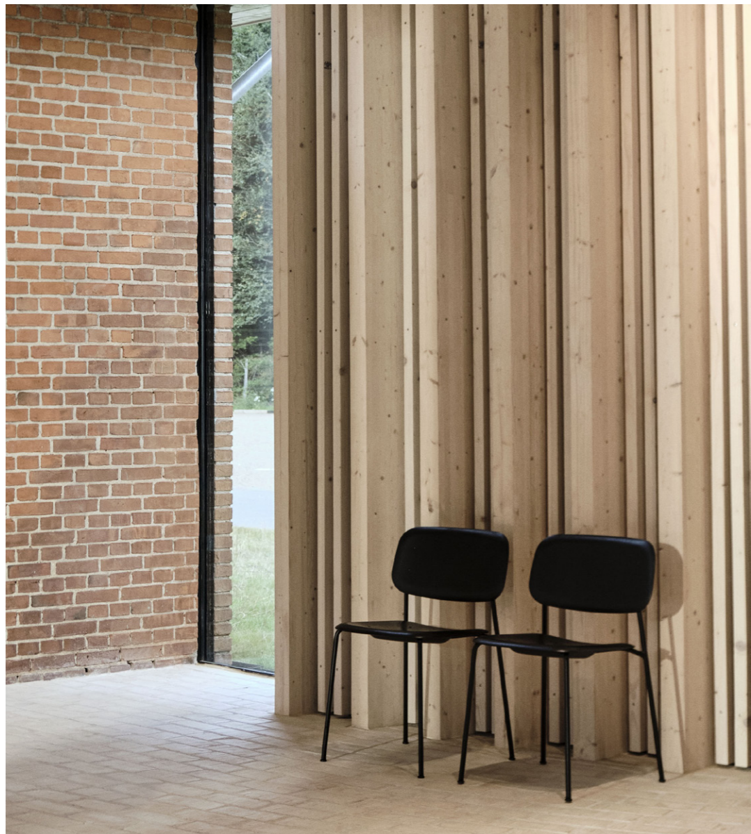
Soft Edge 40 Chair | Black water-based lacquered oak seat & back | Black powder coated base