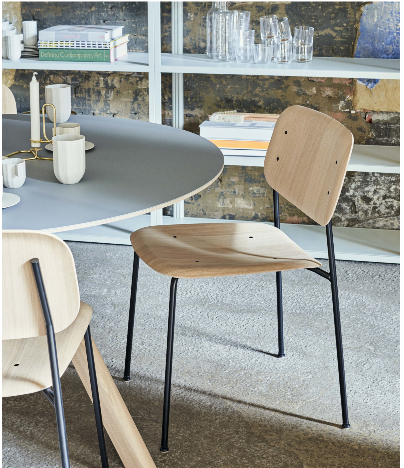
Soft Edge 40 Chair | Water-based lacquered oak seat & back | Black powder coated steel base